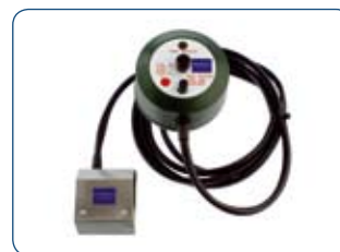
BUND WARNING ALARM