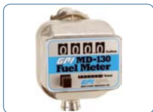
MECHANICAL FLOW METER