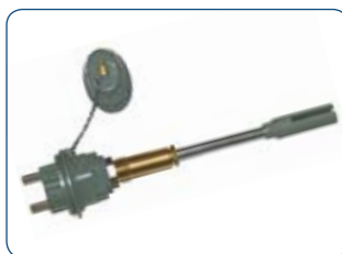
LRC FAILSAFE OVERFILL PREVENTION PROBE