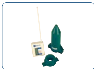
APOLLO ELECTRONIC TANK CONTENTS GAUGE

Suitable for use with Harlequin Bunded Fuel Points and available separately and at additional cost. Please note that if a Mechanical Flow Meter is required, this must be stated at time of order as this option cannot be retrofitted at a later date.